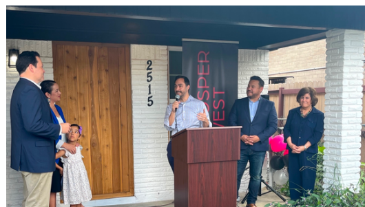
In June, I joined Prosper West to celebrate the completion of the first Casa Bella affordable home on West César E Chávez Boulevard .

This year, I worked closely with Our Casas Residents Council and Prosper West San Antonio on major new Westside affordable housing initiatives to repair homes for seniors and rehabilitate older properties for first-time homebuyers. I've also pushed to bring more federal funding home to support our schools, including through a $2 million grant to hire student success coaches to support math and literacy education in San Antonio public schools.