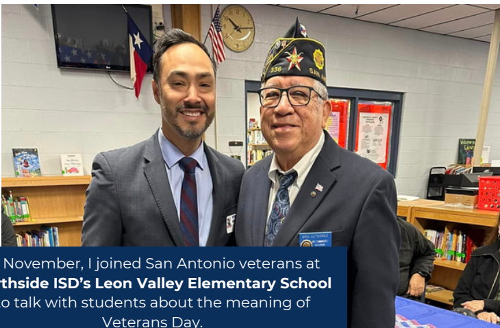
In November, I joined San Antonio veterans at Northside ISD's Leon Valley Elementary School to talk with students about the meaning of Veterans Day.