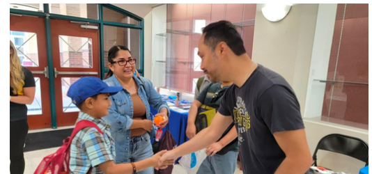
I have great memories from my time living off General McMullen while my dad taught at Kennedy High School and my brother and I attended Hoelscher Elementary . It was fun to visit with the next generation of students and parents at this year's Edgewood ISD back-to-school fair.

Throughout my time in public service, my focus has been on what I call the Infrastructure of Opportunity . I believe that just as there's an infrastructure of transportation that helps us get where we want to go on the road, there's an Infrastructure of Opportunity that helps us we want to go in life. It's that Infrastructure of Opportunity — great public schools and universities, a sound health care system, and good jobs — that opens the door for people to pursue their American Dreams.