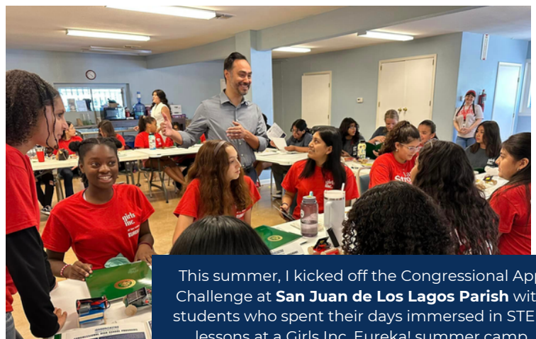
This summer, I kicked off the Congressional App Challenge at San Juan de Los Lagos Parish with students who spent their days immersed in STEM lessons at a Girls Inc. Eureka! summer camp